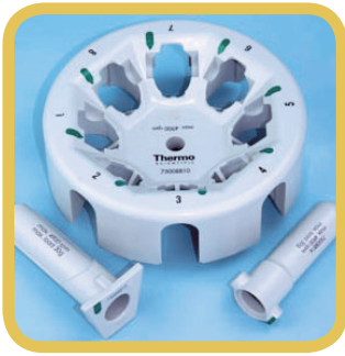
Unique DualSpin rotor with hybrid design