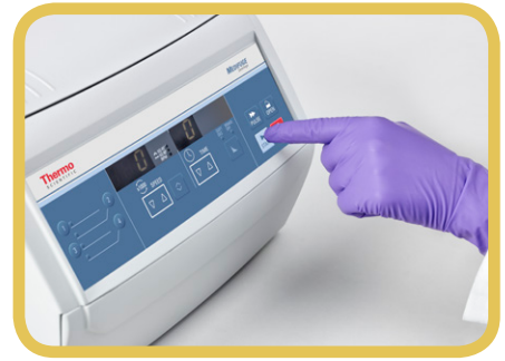
Large, brightly-lit display with intuitive controls