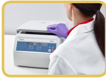
Fast one-click centrifuge lid closure