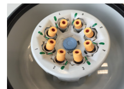
DualSpin rotor with swinging buckets