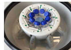
DualSpin rotor with fixed angle buckets